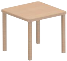
Table or Board