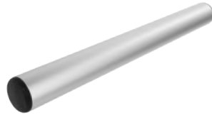
R22,2-200 to R22,2-500

Monty-3D Standard tube kit, including 3 tubes in lengths of 200mm (8"), 400 (16") and 500mm (20").