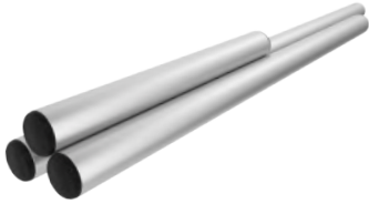
M3D Tubekit #11.1400

Monty-3D Standard tube kit, including 3 tubes in lengths of 200mm (8"), 400 (16") and 500mm (20").