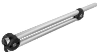
M3D-HD Upgrade-kit #11.1403

Monty-3D upgrade kit to equip any M3D mount with a double tube. Significantly reduces vibration, allows for heavy devices on long mounts.