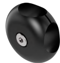
M3D-Connector HD #11.1500

Allows for quick removal of the entire mount directly at the wheelchair frame. (Only for double tube mounts)