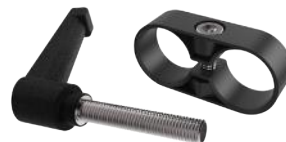
Easy-Off Kit for EyeControl HD #11.1510

Monty-3D upgrade kit to equip any M3D mount with a double tube. Significantly reduces vibration, allows for heavy devices on long mounts.